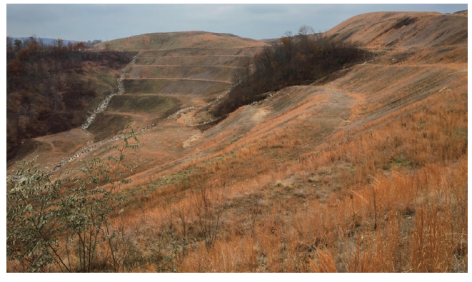
Photo of a West Virginia surface mine.

The coal industry across the seven Eastern states has lost about 27,000 jobs over the last 10 years — a decline of about 46%. Addressing the reclamation backlog could put a substantial number of people back to work. If the remaining 633,000 acres in need of reclamation were reclaimed, this would create between 23,000 and 45,000 job-years across the Eastern states. Proper mine reclamation could have significant positive economic impacts, and contribute to methane mitigation, carbon sequestration and climate change resilience.